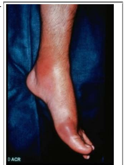
The base of the big toe and ankle are red, swollen, and extremely painful due to an acute attack of gout. As the attack subsides, the superficial skin may peel.

by use of low-dose colchicine or NSAIDs are advised. Pegloticase ( Krystexxa ) is given by injection and breaks down uric acid. It can be used in patients who have failed or do not tolerate the other treatments. Additional new agents to normalize uric acid levels and to treat gouty inflammation are under development.