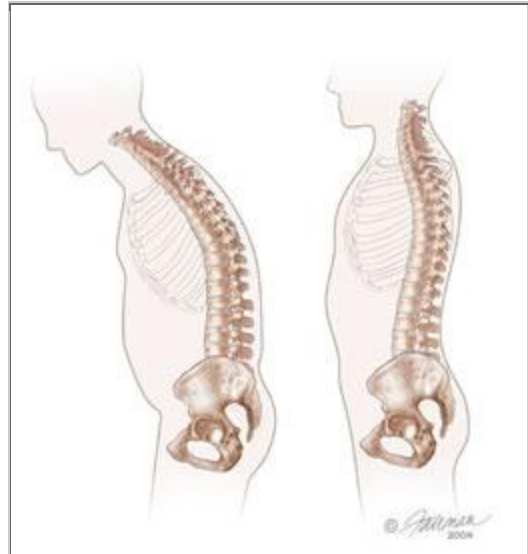
Over time, spondylitis results in pronounced curvature of the spine (left).

Correct diagnosis requires a physician to evaluate the patient's history and do a physical examination. The physician also may do two other types of evaluation. One is ordering an X-ray of the sacroiliac joints, a pair of joints in the pelvis. X-ray changes of the sacroiliac joints known as sacroiliitis is a key sign of spondylarthritis. If X-rays do not show adequate changes, but the symptoms are highly suspicious, a physician might decide to visualize the sacroiliac joints with MRI. Besides imaging, the second type of supplementary tests are blood tests for HLA-B27, and sometimes also for acute phase reactants such as C-reactive protein. Ultimately, diagnosis relies on the judgment of the attending physician. There are people who have a positive HLA-B27 gene test, but do not have arthritis and never develop arthritis. Therefore, a positive test does not mean that someone will develop spondylarthritis in the future.